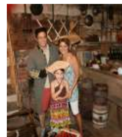
This Ashburn, VA family loved coming to Poolesville. We need more visitors!